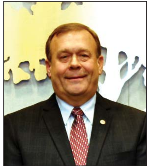
Mayor Stan Karwoski