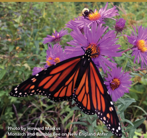
Monarch and Bumble Bee on New England Aster